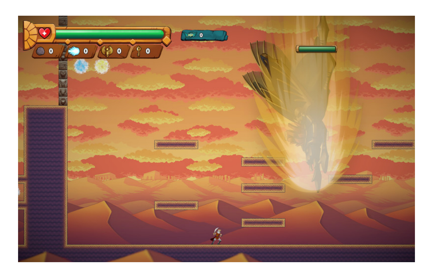
KingOfEgyptGX Activation Code And Serial Key For Pc

Download ->>->> <a href="http://bit.ly/2NG1mSy">http://bit.ly/2NG1mSy</a>